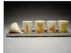
14 Schmidt-Vintage Paper Cups