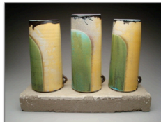
13 Schmidt-3 Vase Set