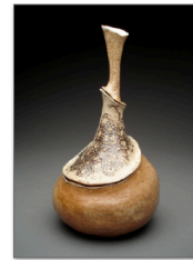
09 Samantha Reid-Stacked Form