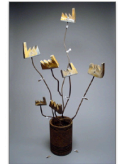
20 Schmidt-Factory Plant