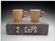
11 Schmidt-2 Cups