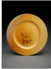
02 Schmidt-Eat Platter