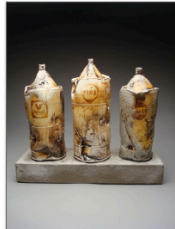
12 Schmidt-Oil Bottles Set 2