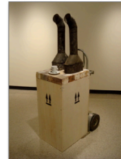
19 Schmidt-Industrial Complex 9.09b