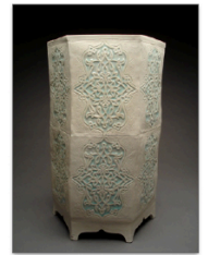
10 Cindy Quick-Jar