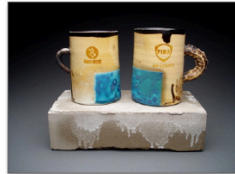
07 Schmidt-Oil Cups