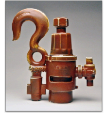
05 Zach Mickleboro - Industrial Teapot