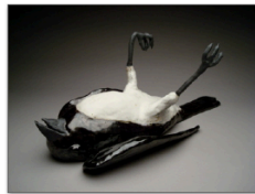
13 Kelly Cook - 2 foot Bird