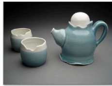
08 Trisha Klyber-Teapot Set