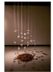
17 Rachel Burk - Installation