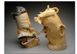
15 Meagan Moore-Figures