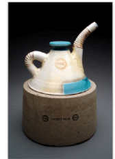
10 Schmidt-Pure Oil Can