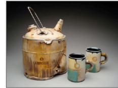
09 Schmidt-Oil Can Set