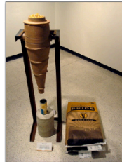
18 Schmidt-Alt. Industrial Complex ...