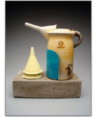
05 Schmidt-Kendall Oil Can