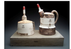
15 Schmidt-Mobil Oil Set