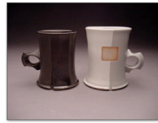
04 Mat McConnell-2 Cups