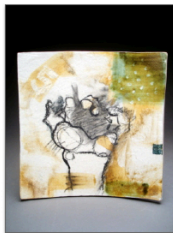
12 Janelle Wisehart-Plate