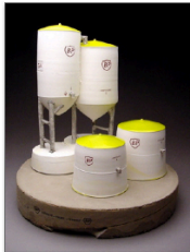
16 Schmidt-8P Oil Complex