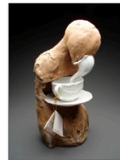
14 Fancis Matia-Figure