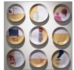
20 Abbie Preston-Secret Plates Detail