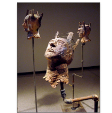
18 Abbie Preston-Figure Install