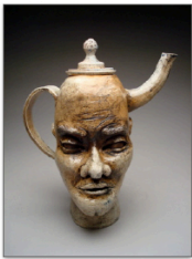
06 Kelly Cook-Teapot