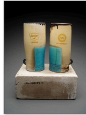
03 Schmidt-Oil Cups