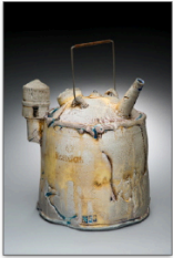
01 Schmidt-Kendall Oil Can