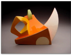
01 Mat McConnell-Teapot