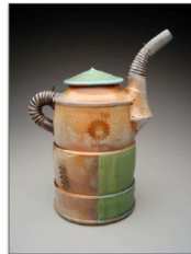
08 Schmidt-8P Oil Can