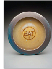
04 Schmidt-Eat Platter