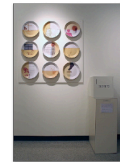
19 Abbie Preston-Secret Plates