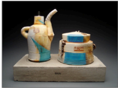
06 Schmidt-Oil Set