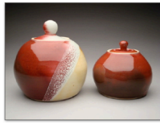
03 Casey Fowler-Jar Set